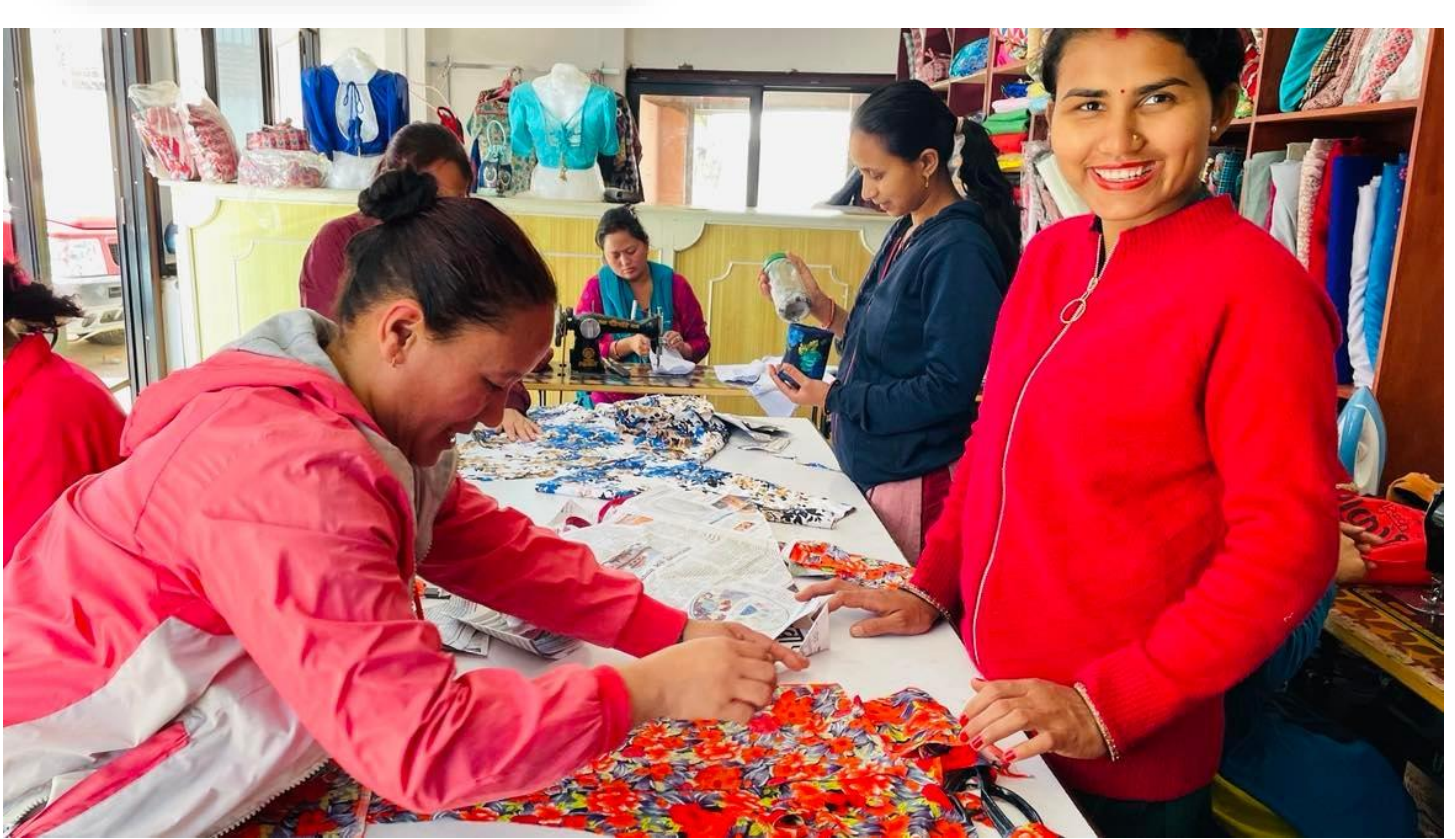
Training in Imadole (Aanandit office)