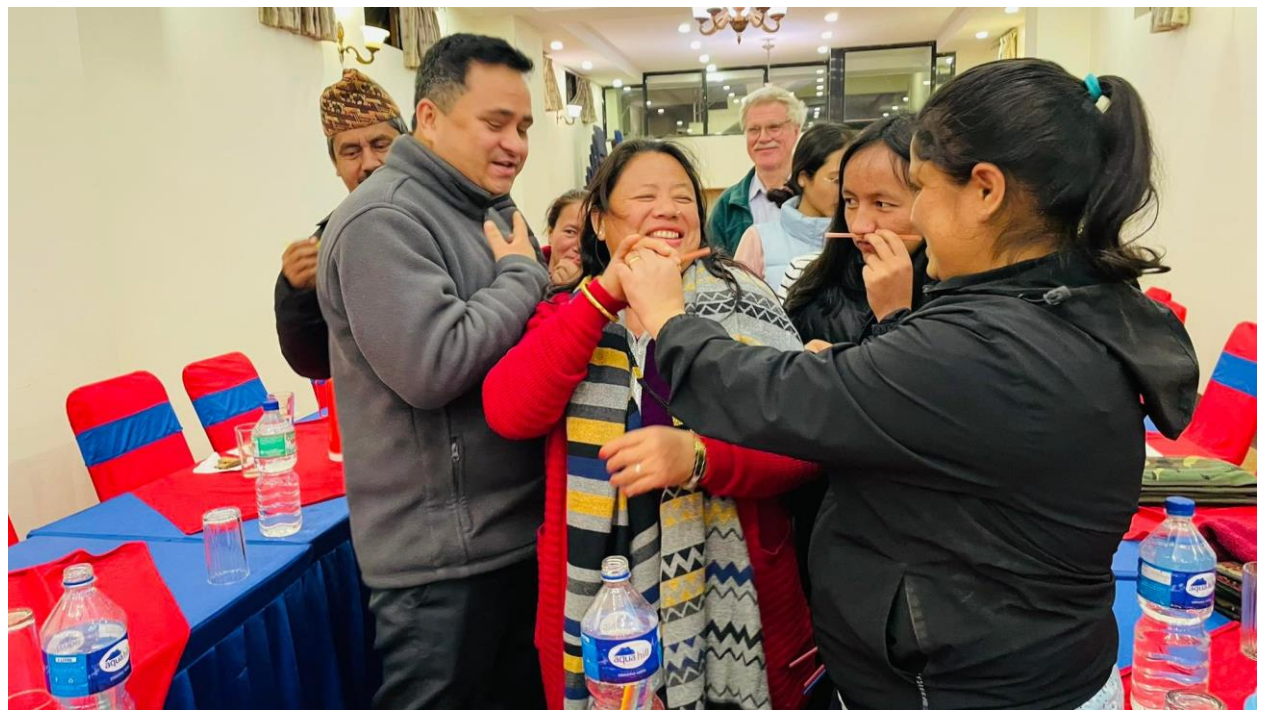
We played, ate, received God's word and prayed together...