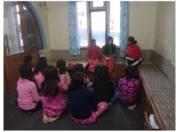
Fellowship: girls leading the fellowship