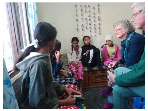
English Conversation Class