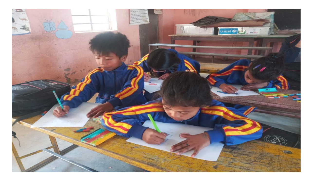
One of the classes... We have a plan to have a regular empowering program for them.