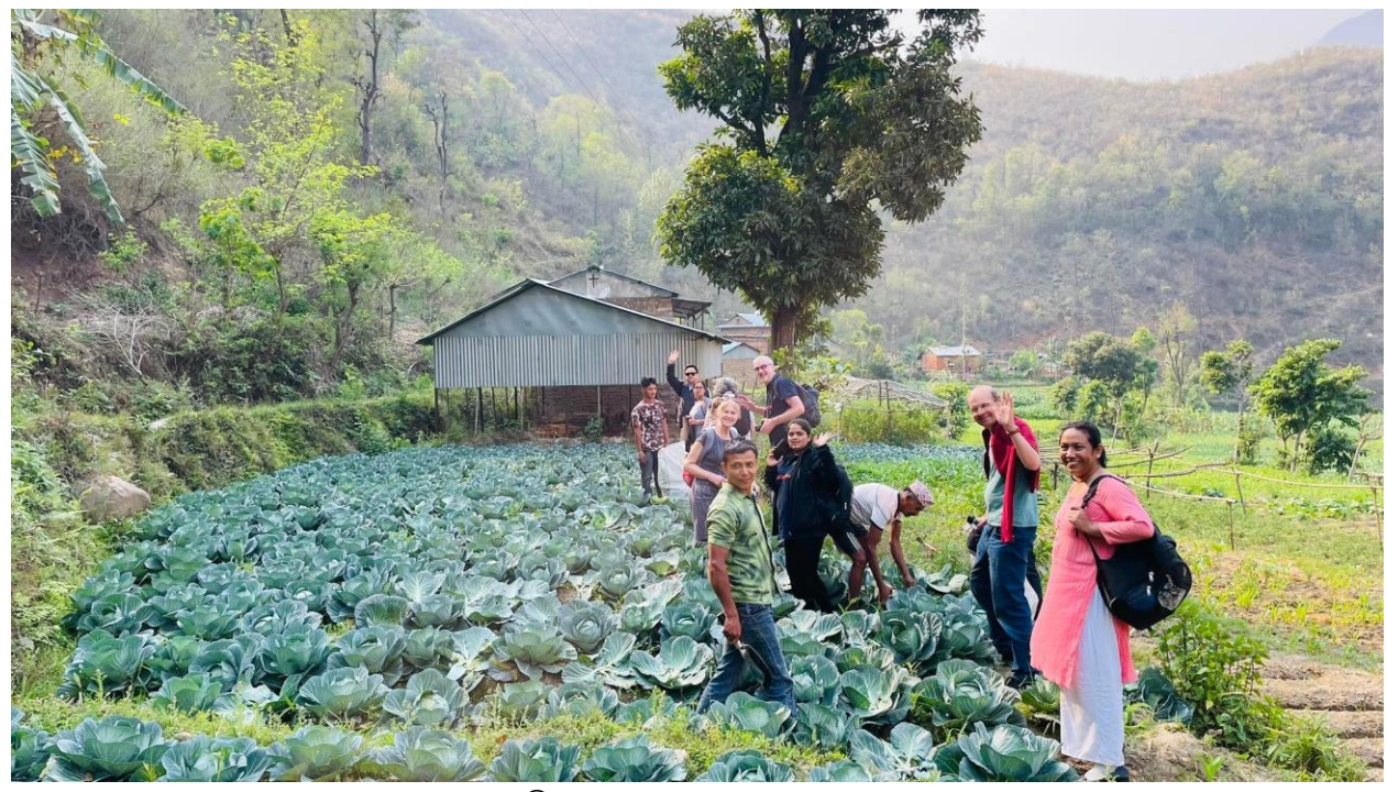
Sindhuli Farm; cabbages in the field ! We struggle to get good market price.