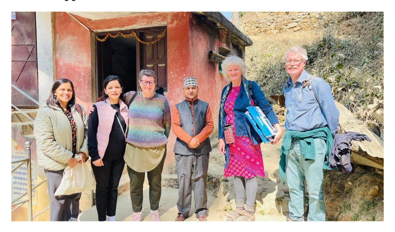
Meeting with Headmaster in a local government school