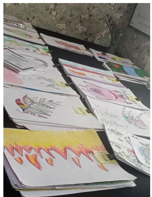
Their art work